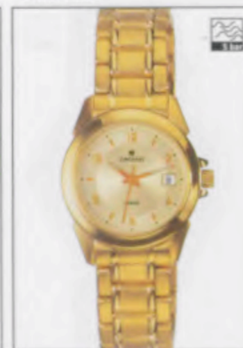
047/7871.44 »Cicero« quartz GE-gs-po/Z-cl-gs-po/M-gh/D/Lz/BE-gs-po/S 047/7871.44