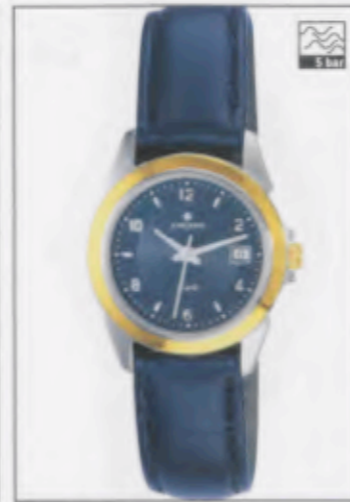
047/4864.00 »Cicero« quartz GE-gs/LE-gv-po-/Z-gs-po/M-gh/D/Lz/BU/S 047/4864.00