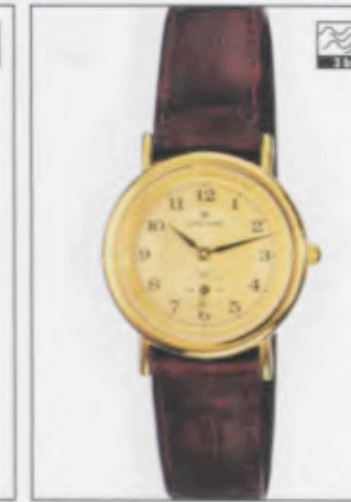
047/5841.00 »Seneca« quartz GE-gv-gi-po/Z-cl/M-gh/BU/S 047/5841.00