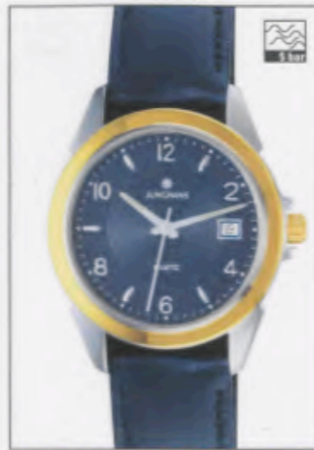
041/4864.00 »Cicero« quartz GE-gs/LE-gv-po-/Z-gs-po/M-gh/D/Lz/BU/S 041/4864.00