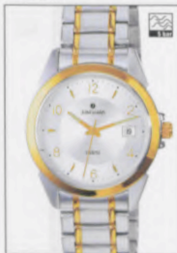
041/4866.44 »Cicero« quartz GE-gv/LE-gs-po/Z-sl-gs-po/M-gh/D/Lz/BE-gs-po/S 041/4866.44