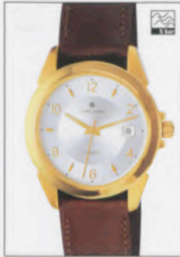
041/7870.00 »Cicero« quartz GE-gv-gs-po/Z-sl-gs/M-gh/D/Lz/BU/S 041/7870.00