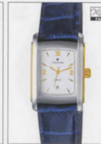
041/4870.00 »Platon« quartz GE-bi-gs-po/Z-cl/M-gh/D/BU/S 041/4870.00