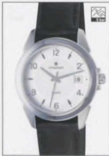
041/4863.00 »Cicero« quartz GE-gs/Z-gs-po/M-gh/D/Lz/BU/S 041/4863.00