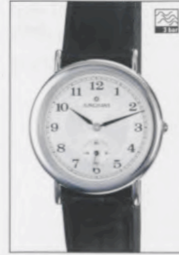
041/3841.00 »Seneca« quartz GE-po/Z-sl/M-gh/BU/S 041/3841.00