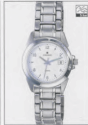
047/4865.44 »Cicero« quartz GE-gs-po/Z-gs-po/M-gh/D/Lz/BE-gs-po/S 047/4865.44