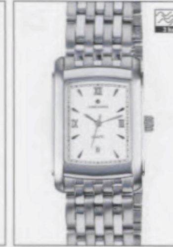
041/4871.44 »Platon« quartz GE-gs-po/Z-sl-gs/M-gh/BE-gs-po/S 041/4871.44