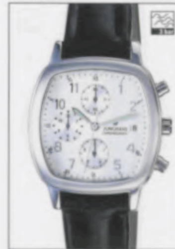
041/4868.00 »Vergil« quartz Chronograph GE-gs-po/Z-sl-gs/M-gh-gw/D/Lz/BU/S 041/4868.00