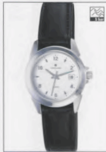
047/4863.00 »Cicero« quartz GE-gs/Z-gs-po/M-gh/D/Lz/BU/S 047/4863.00