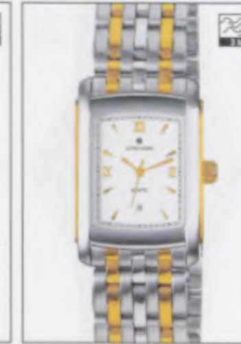
041/4872.44 »Platon« quartz GE-bi-gs-po/M-gh/BE-bi-gs-po/S 041/4872.44