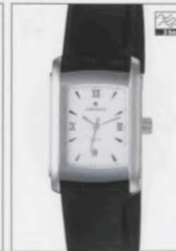
041/4869.00 »Platon« quartz GE-gs-po/Z-sl-gs/M-gh/D/BU/S 041/4869.00