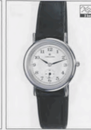
047/3841.00 »Seneca« quartz GE-po/Z-sl/M-gh/BU/S 047/3841.00