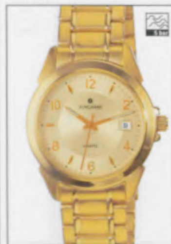
041/7871.44 »Cicero« quartz GE-gs-po/Z-cl-gs-po/M-gh/D/Lz/BE-gs-po/S 041/7871.44