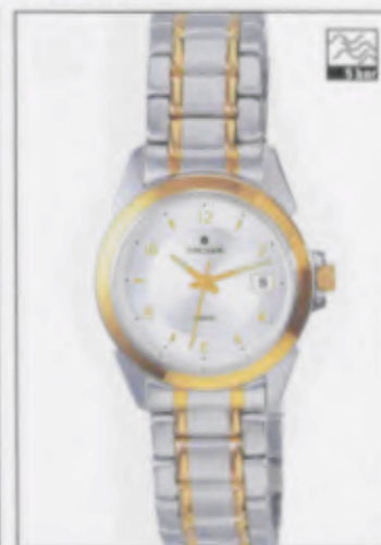
047/4866.44 »Cicero« quartz GE-gv/LE-gs-po/Z-sl-gs-po/M-gh/D/Lz/BE-gs-po/S 047/4866.44