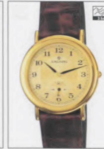
041/5841.00 »Seneca« quartz GE-gv-gi-po/Z-cl/M-gh/BU/S 041/5841.00