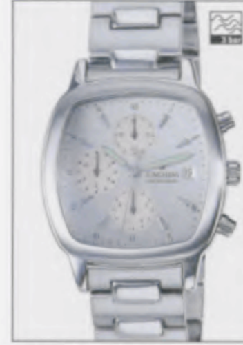
041/4867.44 »Vergil« quartz Chronograph GE-gs-po/Z-sl-gs/M-gh-gw/D/Lz/BE-gs-po/S 041/4867.44