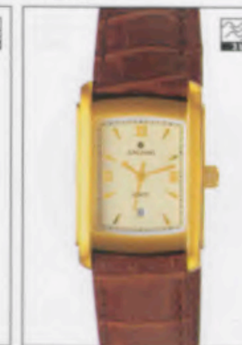
041/7869.00 »Platon« quartz GE-gs-po/Z-cl/M-gh/D/BU/S 041/7869.00