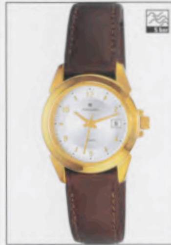
047/7870.00 »Cicero« quartz GE-gv-gs-po/Z-sl-gs/M-gh/D/Lz/BU/S 047/7870.00