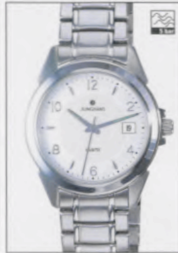
041/4865.44 »Cicero« quartz GE-gs-po/Z-gs-po/M-gh/D/Lz/BE-gs-po/S 041/4865.44