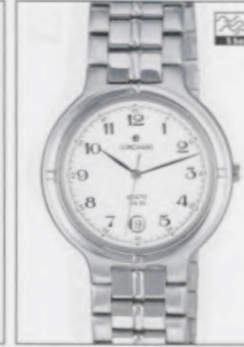
041/4735.44 »Platon« quartz GE/Z-po/M/D/S 041/4735.44