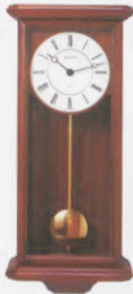
③ 390/1055 320/1055