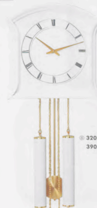
③ 320/1029 390/1029