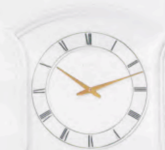
③ 320/1030 390/1030

③ 320/1029 "Bim-Bam" 31.0 x 31.0 cm Wooden case, white lacquered. Brass surface mounted figure ring, diamond finished, lac- quered. W 749