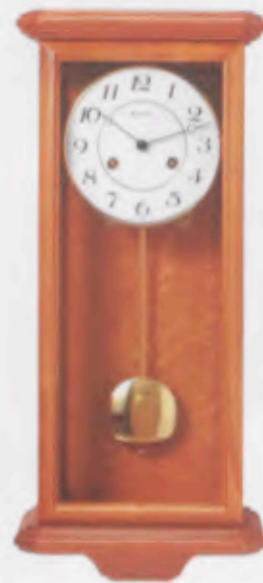
③ 390/1056 320/1056