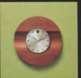
358/3005 resonic Ø 25 cm MS-vc/PAG