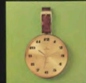
368/6004 quartz Ø 25 cm AL-gl/LAG**)

Technische Beschreibung Seite 33-37 / Technical description page 33-37 Description technique page 33-37 / Descrizione tecnica pagina 33-37