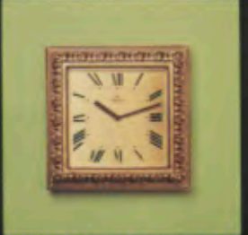
358/5000 resonic 25 x 25 cm PUG-pa