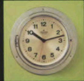
358/5023 resonic Ø 22,5 cm MSG-vc