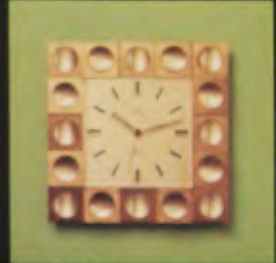
368/6002 quartz 28 x 28 cm AL-el/PSG**)