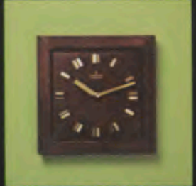
358/4007 resonic 25,5 x 25,5 cm LEG