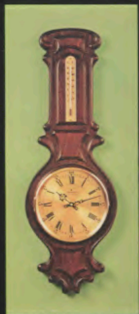
358/5033 resonic 22 x 63 cm HOG/TH