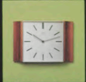
358/4006 resonic 30 x 20 cm AL/PAG