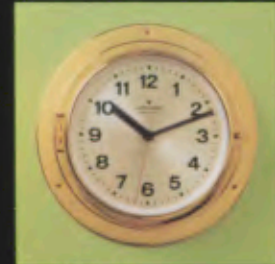
358/5021 resonic Ø 22,5 cm MSG