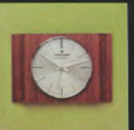
358/4001 resonic 30 x 20 cm PAG