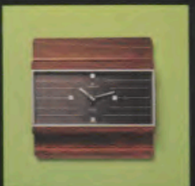
358/3003 resonic 26 x 26 cm PA/ALG