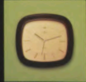
368/6001 quartz 29 x 27 cm PUG-pa**)