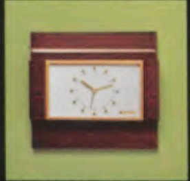
368/1003 quartz 28 x 26 cm MS/MAG-po*)