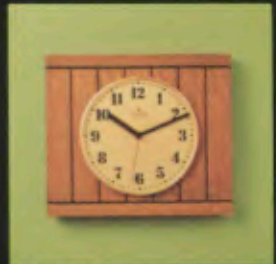
358/5009 resonic 27 x 23,5 cm EIG