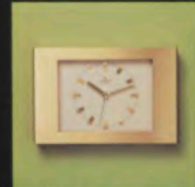
368/5003 quartz 30 x 20 cm ALG-gl**)