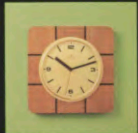
358/5008 resonic 25 x 25 cm NUG