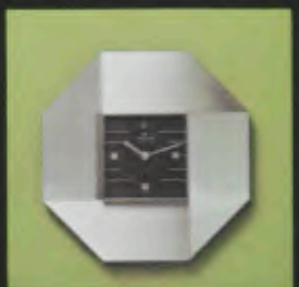
358/3001 resonic 29 x 29 cm AL-sl/HOG