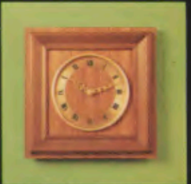
358/5014 resonic 27 x 27 cm NUG