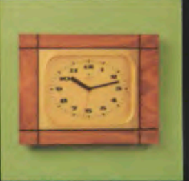
358/5003 resonic 28 x 22 cm NUG