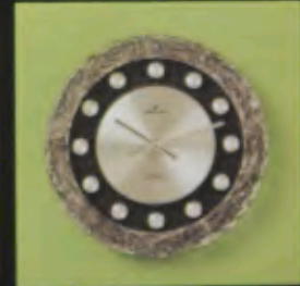
368/6000 quartz Ø 30 cm PS/ALG-fl**)