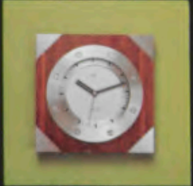
368/1004 quartz 25 x 25 cm AL/PAG**)