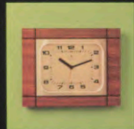
358/5004 resonic 28 x 22 cm PAG