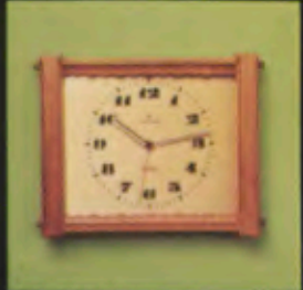
368/6003 quartz 32 x 25 cm EIG**)