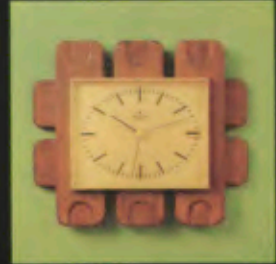
358/5024 resonic 32 x 27 cm MS/EIG