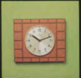
358/5012 resonic 27 x 22,5 cm EIG