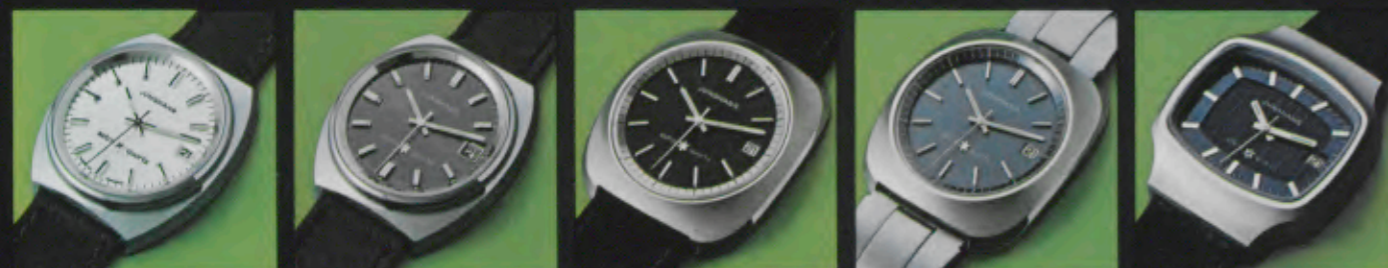
010/1001* C/Lz/D/SK/Wd/ 5 atü/W 666

Orologi da polso per signori astro-quartz