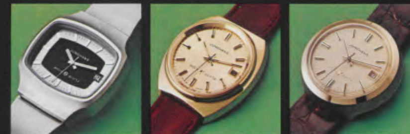
010/4504* E/M/Lz/D/SK/Wd/ 5 atü/W 666