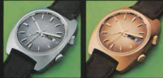
089/4501* E/Lz/DD/SK/Wd/ 5 atü/W 640

Orologio da polso automatico con sveglia «top-timer»