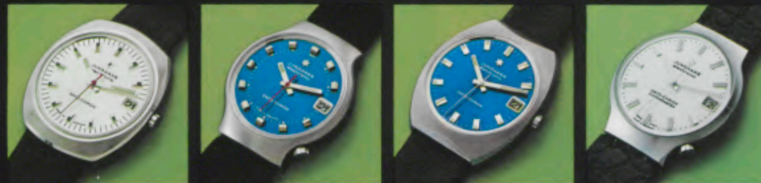
067/4656 E/Lz/D/Wd/W 600

Orologi da polso per signori elettronico