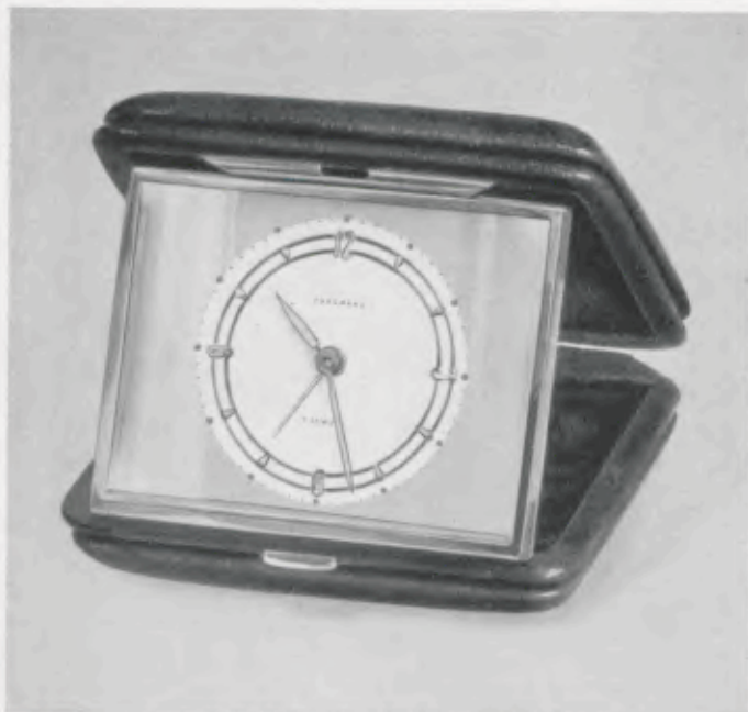
Detachable Boudoir clock

Gilt frame. Silver dial with polished raised figures, luminous points and hands. Flat alarm movement with 7 jewels. Polished back bell, dustproof, interchangeable spring barrels.