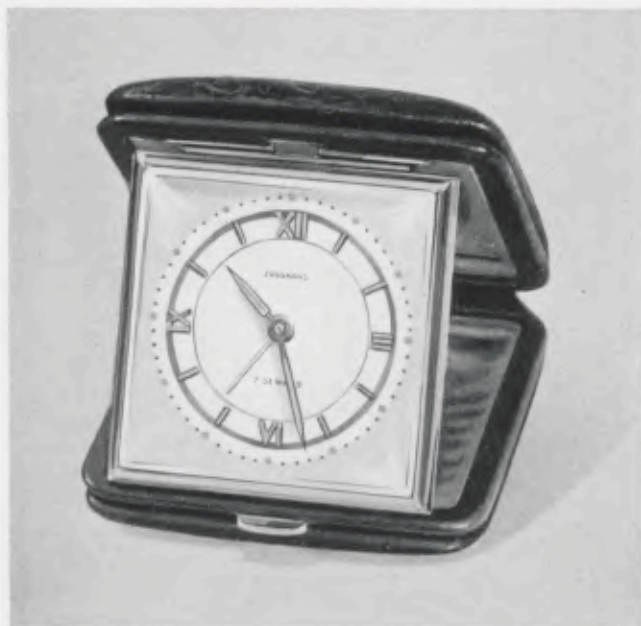
Detachable Boudoir clock

Gilt frame. Bevelled convex glass, silver dial with polished raised figures, luminous points and hands. Flat alarm movement with 7 jewels, polished back bell, dustproof, interchangeable spring barrels.