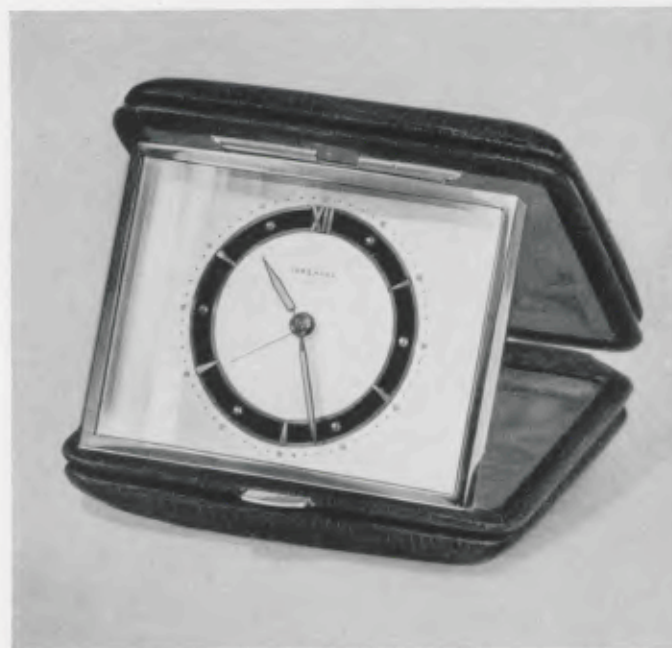
Detachable Boudoir clock

Gilt frame. Two-coloured silver dial with polished raised figures, luminous points and hands. Flat alarm movement with 7 jewels, polished back bell, dustproof, interchangeable spring barrels.