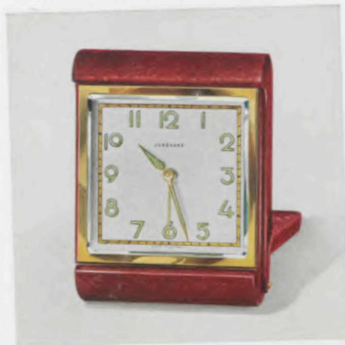
8.1 x 6.1 cm = 3 1/4 x 2 1/4 inches

Gilt frame, bevelled glass, silver dial with luminous figures and hands.