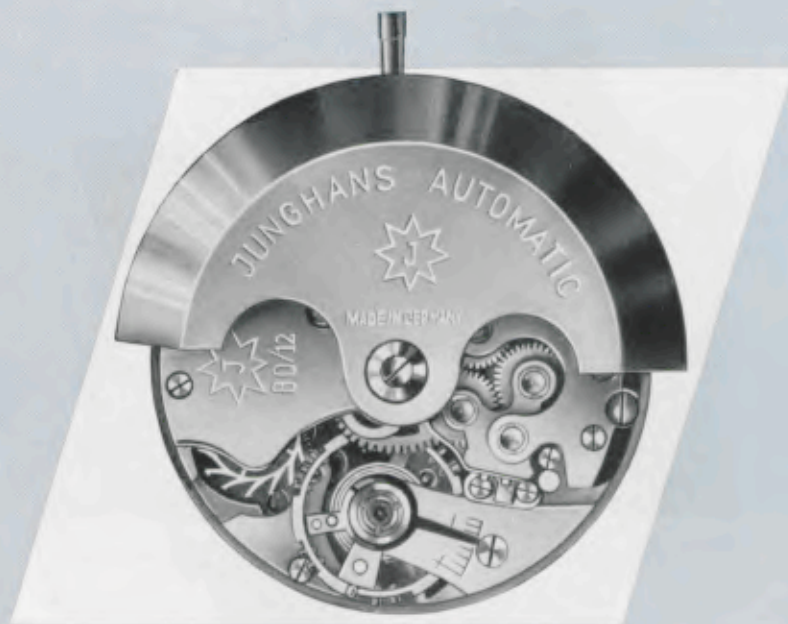
J 80/12, 10 1/2", AUTOMATIC

The solid lever movement J 80, long-known and reputed, is fitted with a wellconstructed and tested automatic selfwinding.