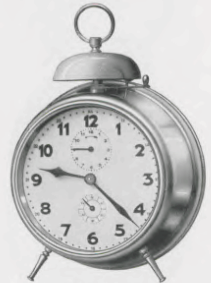
Height 7 inches Diameter of Case at back 5 inches

08/1003 Nickelled 08/1004 Burgundy Brown 08/1005 Blue 08/1006 Green (old No. 9052½ 8209½)