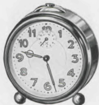
Height 4 \frac{1}{2} inches Diameter of Case 3 \frac{3}{4} inches