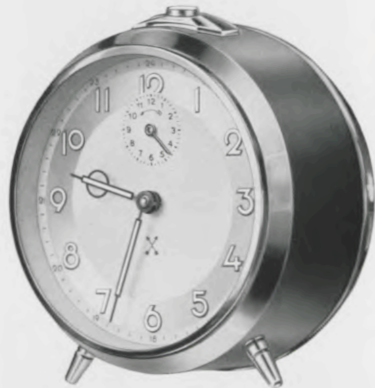
ILLUSTRATING LIFE-SIZE OF "HAC" 4 INCH ALARM CLOCK