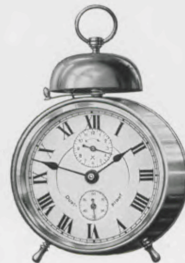
Height 7 inches Diameter of Case 4 \frac{1}{2} inches