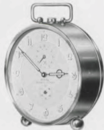
Height 5 1/4 inches Diameter of Case 4 1/4 inches