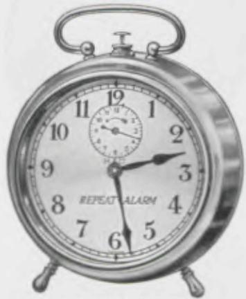
Height 5 \frac{1}{4} inches Diameter of Case 4 \frac{1}{8} inches