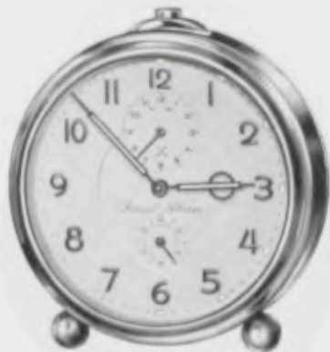
Height 5 inches Diameter of Case 4 \frac{1}{8} inches