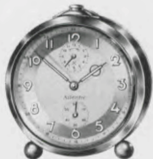
Height 4 \frac{1}{4} inches Diameter of Case 3 \frac{3}{4} inches