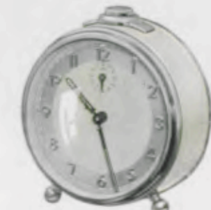
Height 3 \frac{1}{4} inches Diameter of Case 3 \frac{1}{8} inches