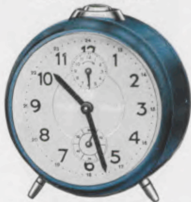
Height 4 \frac{1}{4} inches Diameter of Case 3 \frac{3}{4} inches