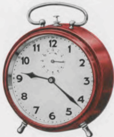
Height 5 \frac{1}{4} inches Diameter of Case 4 \frac{1}{4} inches Hippo Alarm