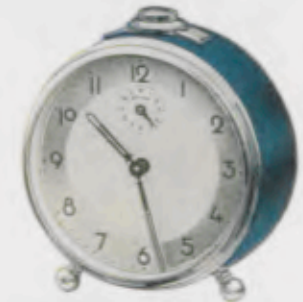
Height 3 \frac{1}{4} inches Diameter of Case 3 \frac{1}{8} inches