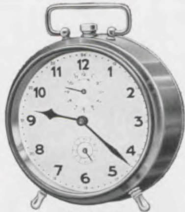
Height 4 \frac{1}{4} inches Diameter of Case 3 \frac{3}{4} inches