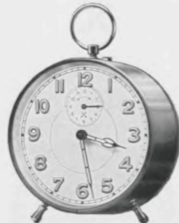
Height 6 inches Diameter of Case 4 inches