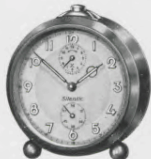
Height 4 \frac{1}{4} inches Diameter of Case 3 \frac{3}{4} inches