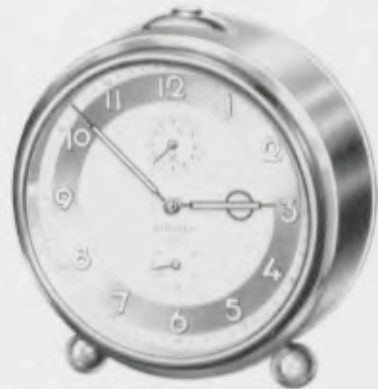
Height 5 inches Diameter of Case 4 1/2 inches