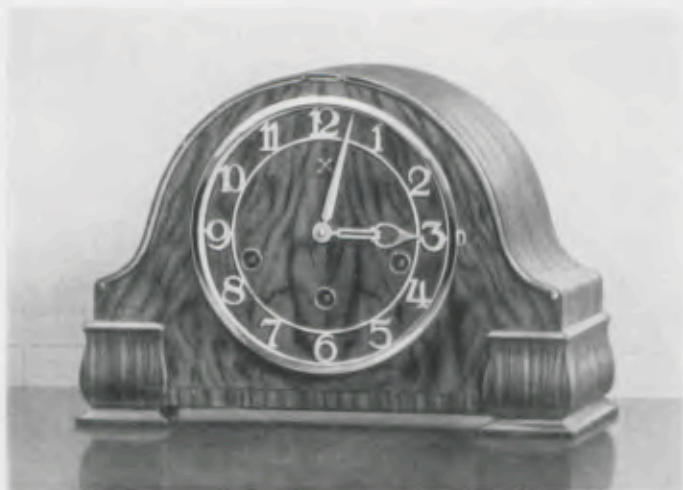
7 \frac{1}{2} x 10 \frac{1}{4} inches

Manufacturers also of all kinds of Chrome Clocks & Wood Timepieces, Bracket & Chime Clocks