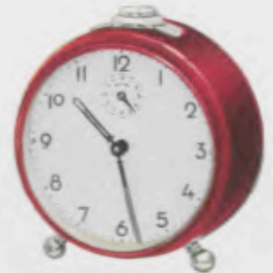
Height 3 \frac{1}{4} inches Diameter of Case 3 \frac{1}{8} inches