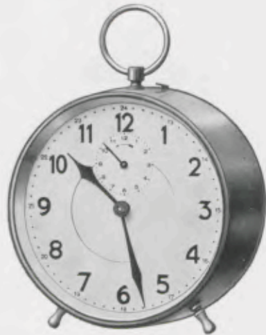
Height 6 inches Diameter of Case 4 inches