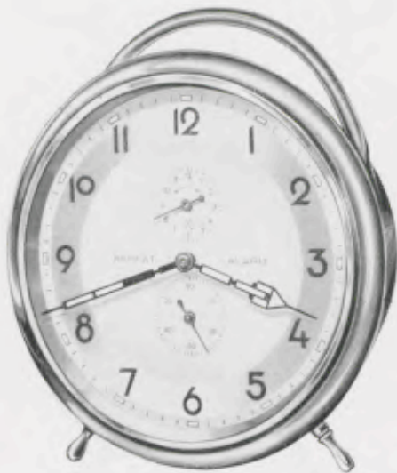
Height 6 1/4 inches Diameter of Case 5 1/4 inches Luxor Repeat Alarm Motor Lamp Shaped Case with Large Convex Glass