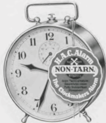
Height 5 1/4 inches Diameter of Case 4 inches