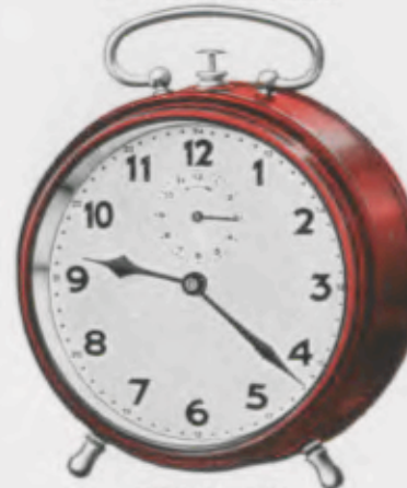
Height 5 \frac{1}{4} inches Diameter of Case 4 \frac{1}{4} inches Hippo Repeat