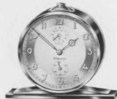
Height 4 \frac{1}{4} inches Diameter of Case 3 \frac{3}{4} inches