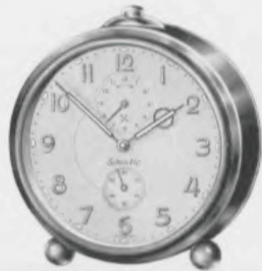
Height 5 inches Diameter of Case 4 1/2 inches