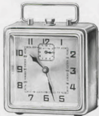
Height 5 inches Diameter of Case 4 inches