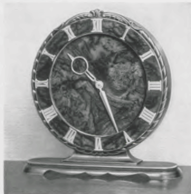
23 x 23 cm = 9 x 9 inches