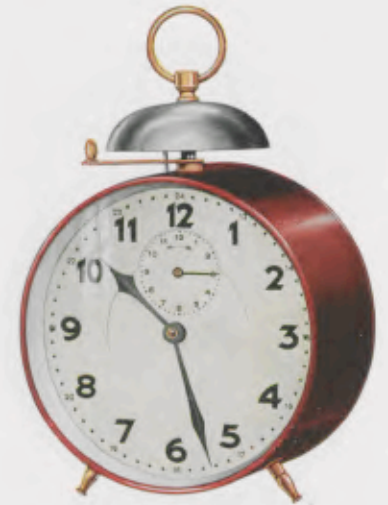
Height 7 inches Diameter of Case 4 inches

08/1000 Nickelled 08/1001 Burgundy Brown (old No. 9043½ 8201½)