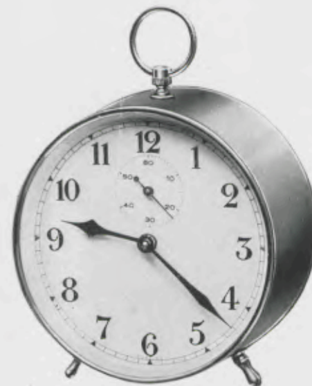
Height 5 \frac{1}{2} inches Diameter of Case 4 inches