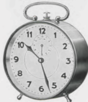
Height 5 \frac{1}{4} inches Diameter of Case 4 inches