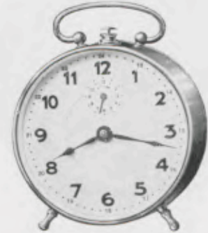
Height 4 3/4 inches Diameter of Case 3 3/4 inches