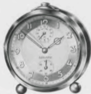
Height 4 1/4 inches Diameter of Case 3 1/2 inches