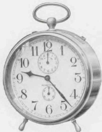
Height 6 1/4 inches Diameter of Case 4 1/4 inches