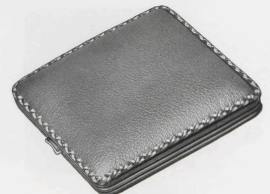
10 x 10 cm = 4 x 4 inches

101/110 RZ Saffian-Schaffleder, braun Brown sheep's skin, morocco grained Mouton grain maroquin, brun Badana tafilete, moreno