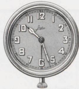
Durchmesser — Diameter — Diamètre Diámetro 6,8 cm = 2 7/8 inches

Travelling watches — Montres de voyage — Relojes para viaje