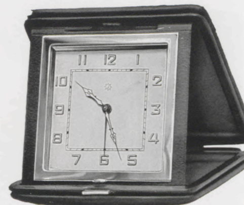
10 x 10 cm = 4 x 4 inches

Máquina completa J 66 (sin estuche) para abertura de estuche de 61 x 61 mm