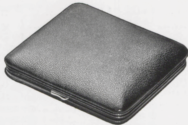
10 x 10 cm = 4 x 4 inches

Máquina completa J 66 (sin estuche) para abertura de estuche de 63 1/2 mm