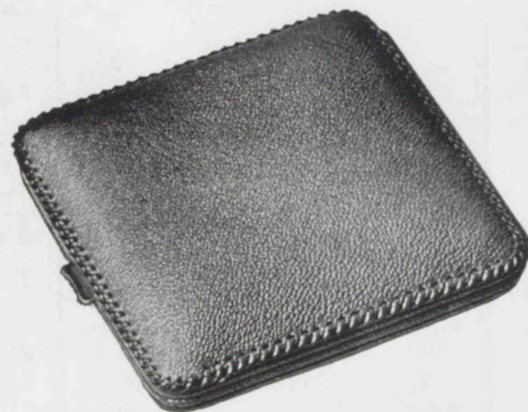
10 x 10 cm = 4 x 4 inches

101/106 RZ Krokodilimitation, dunkelbraun — Brown crocodile, grained — Crocodile grain, brun — Piel de cocodrilo imitación, moreno