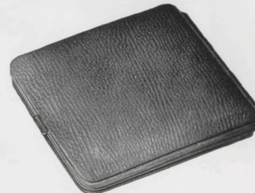
10 x 10 cm = 4 x 4 inches

101/111 RZ Saffian-Schaffleder, braun Brown sheep's skin, morocco grained Mouton grain maroquin, brun Badana tafilete, moreno