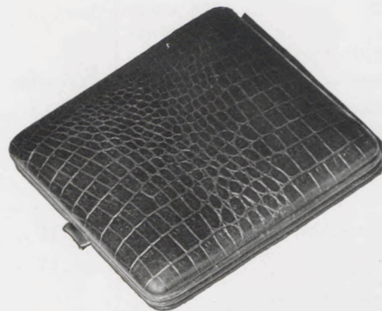
10 x 10 cm = 4 x 4 inches

101/113 RZ Saffian-Schaffleder, dunkelbraun — Brown sheep's skin, morocco grained — Mouton grain maroquin, brun — Badana tafilete, moreno