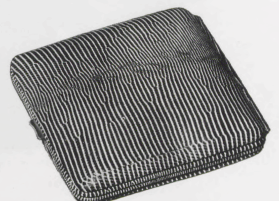
10 x 10 cm = 4 x 4 inches

101/116 RZ Eidechse — Lizard-skin Lézard — Lagarto