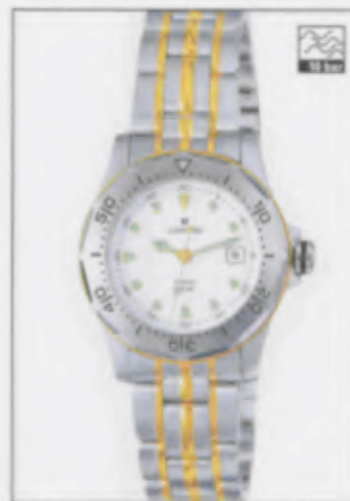
047/4743.44 quartz GE/DU/ZG/M-gh/D/Lzz/VS/BE-bi/S 047/4743.44