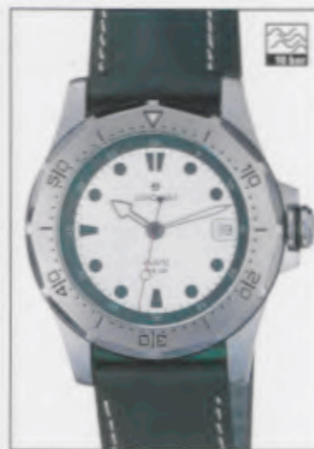
041/4746.00 quartz GE/DU/Z-po/M-gh/D/Lzz/VS/BL/S 041/4746.00