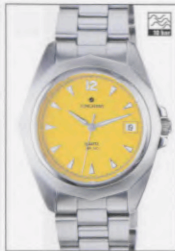
041/4859.44 »Prezisa« quartz GE-gs-po/Z-ml/SA/D/Lzz/VS/BE-gs-po/S 041/4859.44