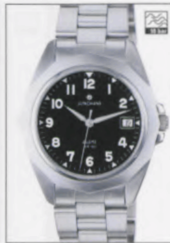
041/4858.44 »Prezisa« quartz GE-gs-po/Z-ml/SA/D/Lzz/VS/BE-gs-po/S 041/4858.44