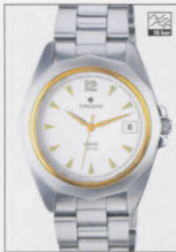
041/4860.44 »Prezisa« quartz GE-bi-gs-po/Z-ml/SA/D/Lzz/VS/BE-gs/S 041/4860.44