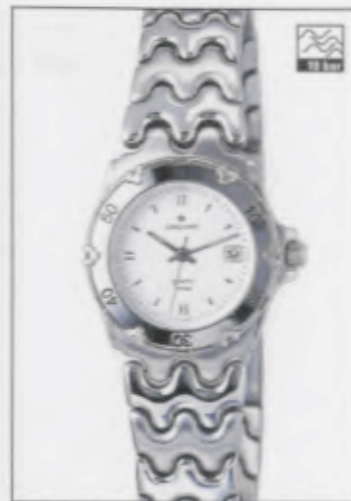
047/4768.44 quartz GE-po-mg/Z-ml/M-gh/D/Lzz/VS/BE-po-mg/S 047/4768.44