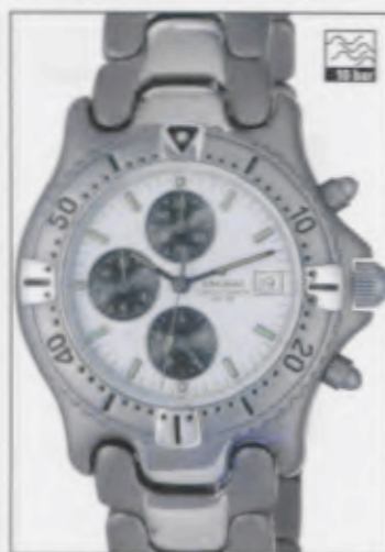
041/2711.44 quartz Chronograph GI-mg/DU/Z-ml/M/D/Lzz/VS/BI-mg/S 041/2711.44