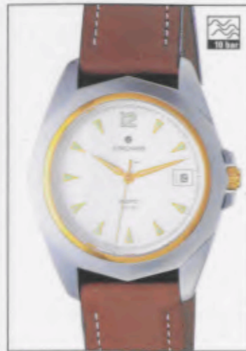
041/4857.00 »Prezisa« quartz GE-bi-gs-po/Z-ml/SA/D/Lzz/VS/BL/S 041/4857.00