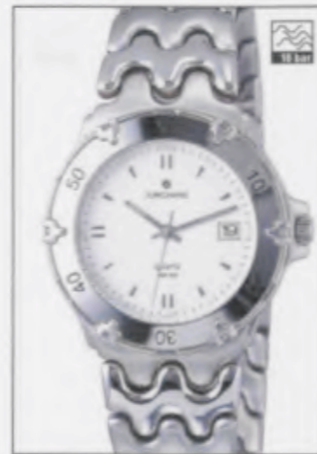
041/4768.44 quartz GE-po-mg/Z-ml/M-gh/D/Lzz/VS/BE-po-mg/S 041/4768.44