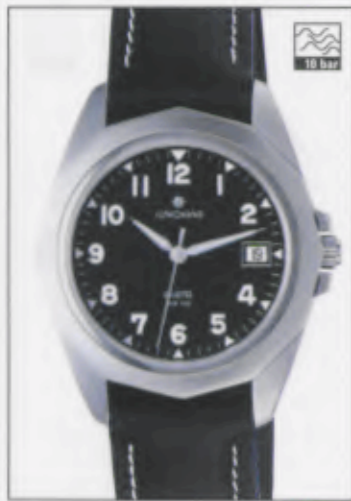
041/4855.00 »Prezisa« quartz GE-gs-po/Z-ml/SA/D/Lzz/VS/BL/S 041/4855.00