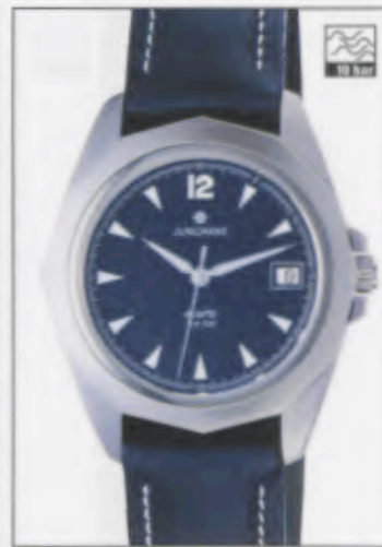
041/4856.00 »Prezisa« quartz GE-gs-po/Z-ml/SA/D/Lzz/VS/BL/S 041/4856.00