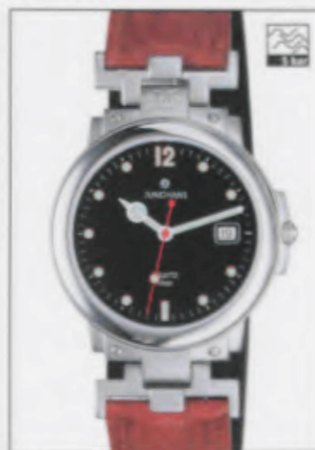
041/4765.00 quartz GE-mg-po/M-gh/D/Lzz/BL/S 041/4765.00