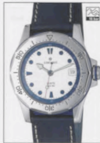
041/4745.00 quartz GE/DU/Z-po/M-gh/D/Lzz/VS/BL/S 041/4745.00