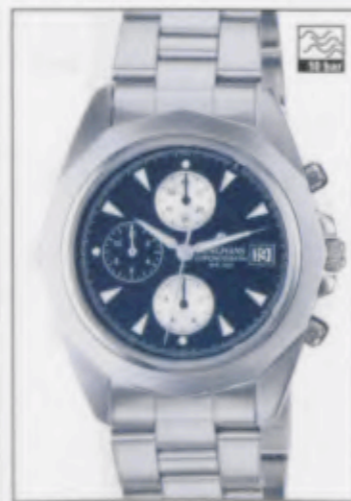
041/4862.44 »Prezisa« quartz Chronograph GE-gs-po/Z-ml/SA/D/Lzz/VS/BE-gs/S 041/4862.44