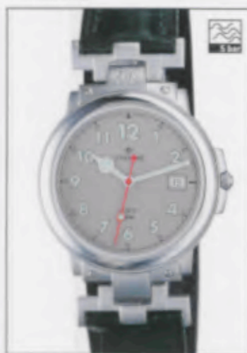
041/4766.00 quartz GE-mg-po/M-gh/D/Lzz/BL/S 041/4766.00