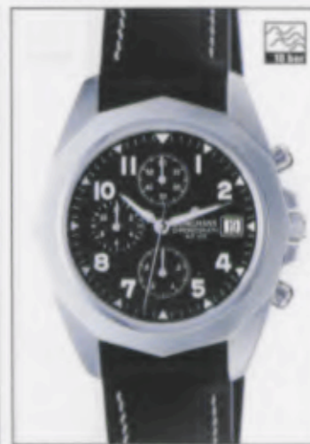
041/4861.00 »Prezisa« quartz Chronograph GE-gs-po/Z-ml/SA/D/Lzz/VS/BL/S 041/4861.00