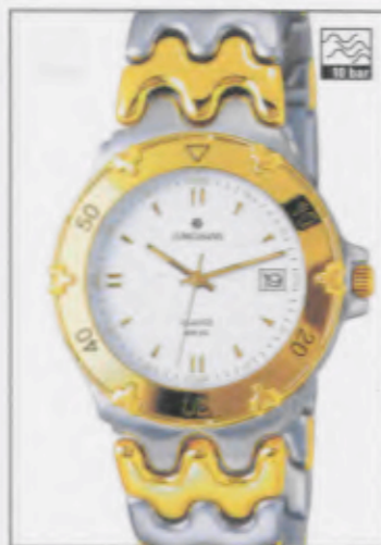
041/4769.44 quartz GE-bi-po-mg/M-gh/D/Lzz/VS/BE-bi-po-mg/S 041/4769.44