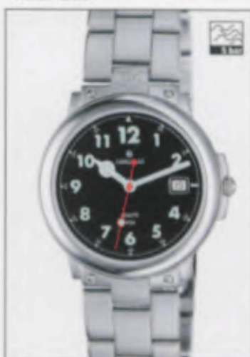
041/4767.44 quartz GE-mg-po/M-gh/D/Lzz/BE-mg-po/S 041/4767.44