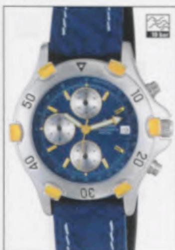
041/4749.00 quartz Chronograph GE-bi/Z-gs/M/D/Lzz/VS/BL/S 041/4749.00