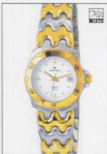
047/4769.44 quartz GE-bi-po-mg/M-gh/D/Lzz/VS/BE-bi-po-mg/S 047/4769.44